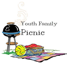
Youth Family Picnic